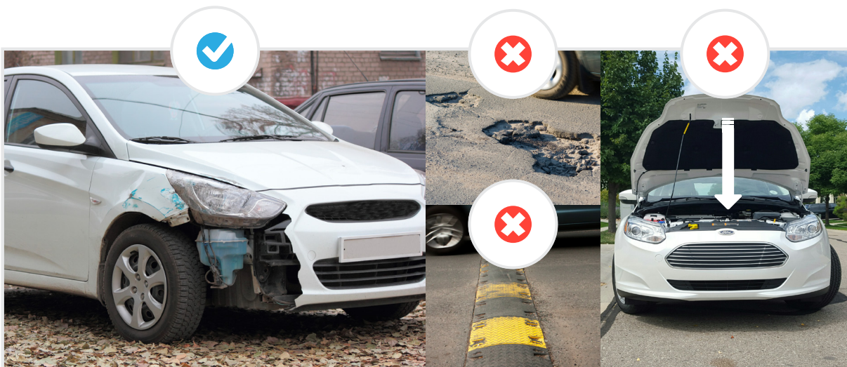
Figure 1 - The CrashCode application discriminates between actual crash events and non-crash noise, such as pot holes, speed bumps, and hood or door slams.